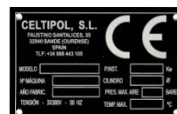
Made in Spain